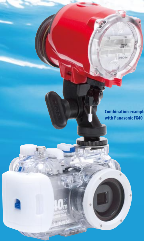
Combination example with Panasonic FX40